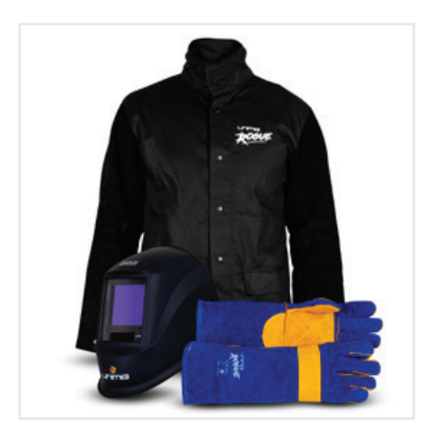
(1) Wear your safety gear. Generally you want the same type of protective gear as when welding. Plasma has high arc voltage if the job or bench is wet and you place your hand or arm on it you can become part of the circuit and receive a shock, be sure you are wearing leather gloves, Full length pants and covered shoes, Wear eye protection a #5 shade is the minimum eye protection with other shades required depending on amperage. A face shield is also recommended