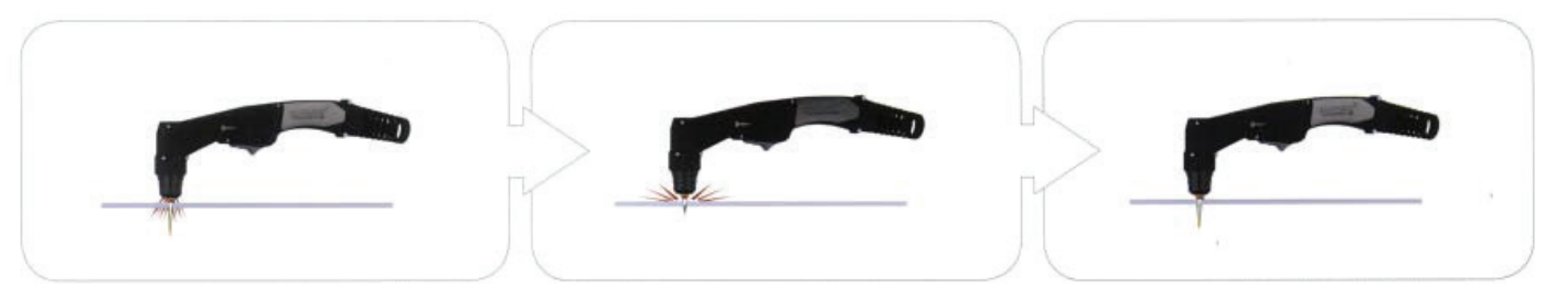
When cutting make sure that sparks are exiting from the bottom of the work piece.