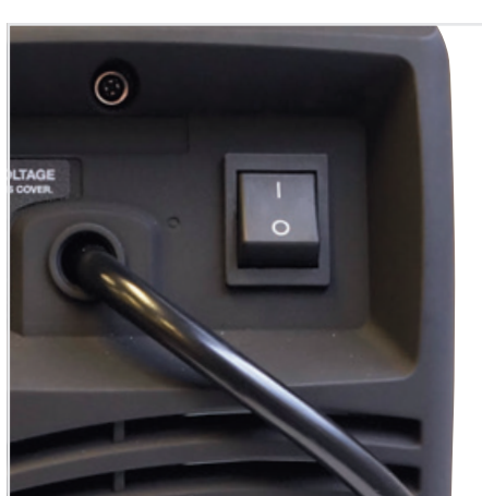
(4) Connect the machine to the correct power supply and switch on the machine using the on/off switch located at the rear of the machine.