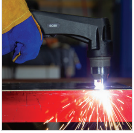
(5) Correct amperage and travel speed are important and relevant to material thickness and are correct when sparks are exiting from the work piece. If sparks are spraying up from the work piece there is insufficient amps selected or the travel speed is too fast.