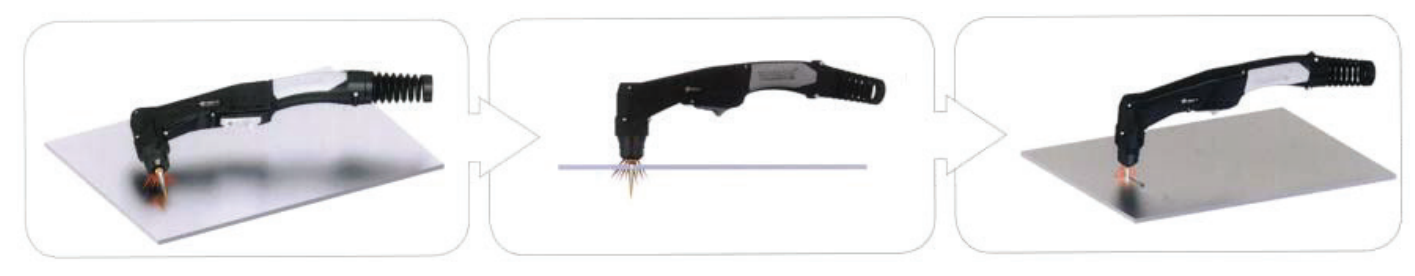
Hold the torch at an angle to the work piece, pull the trigger to start the arc and slowly rotate it to an upright position.