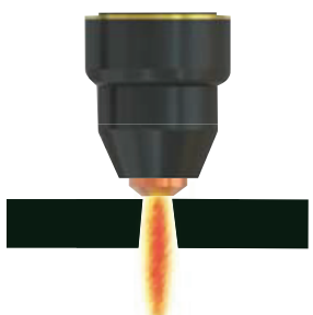
Torch height too low. Reverse bevel. Tip may contact the work and short out or damage the tip.