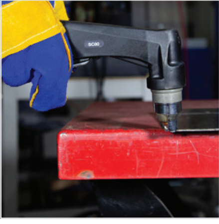
(6) To finish the cutting release the torch switch. The air flow will continue for 30 seconds to cool the torch head. Do not disconnect air until this cooling period has been completed. Failure to do this will result in torch head damage.