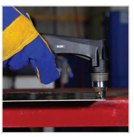
(3) Place and hold the torch vertical at the edge of the