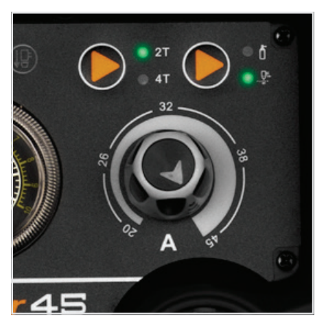
(5) Set 2T / 4T, then set the Amperage dial to the required setting.