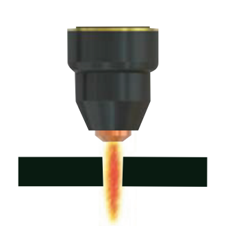
Correct torch height and square to the material. Minimum bevel & equal bevel Longest consumable life.

The distance and position of the plasma torch cutting tip has an affect on the quality of the cut and the extent of the bevel of the cut. The easiest way to reduce bevel is by cutting at the proper speed and height for the material and amperage that is being cut.