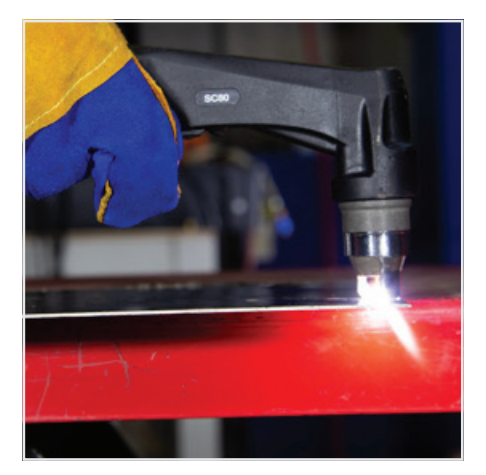
(4) Pull the trigger to energise the arc. When the cutting arc has cut through the edge of the plate start moving evenly in the direction you wish to cut.