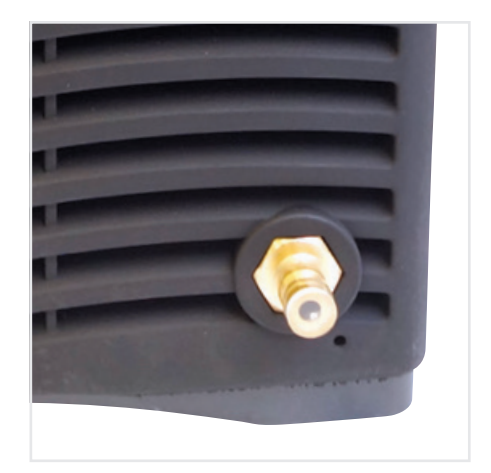
(3) Connect the air supply to the regulator located at the rear of the machine. Set Air Pressure to 0.5MPA (75psi)