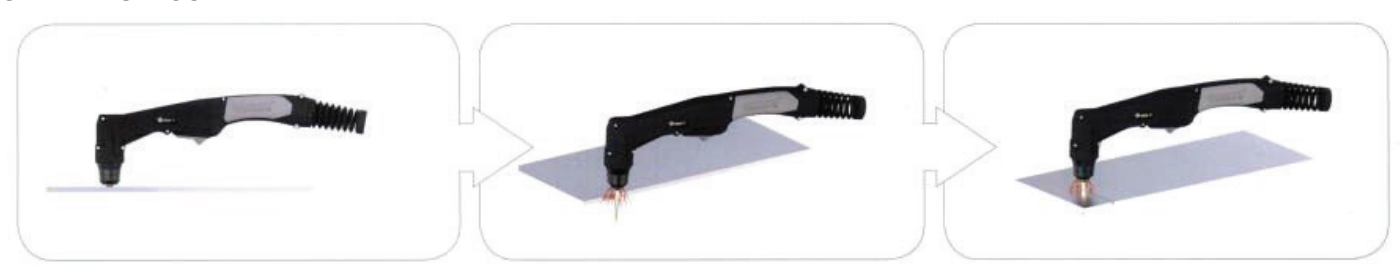
Hold the torch vertical at the edge of the work piece