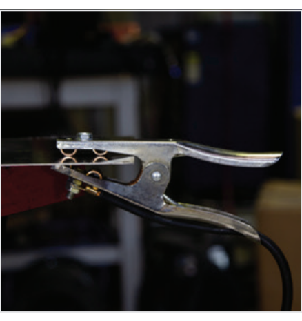
(2) Connect the Earth Clamp securely to the work piece or the work bench.